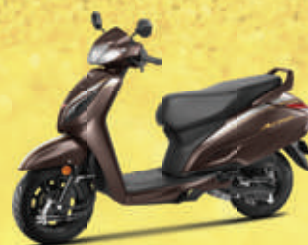
MATTE MATURE BROWN METALLIC

*The technical specifications and design of the vehicle may vary according to the requirements and conditions without any notice • Activa 6G meets Bharat Stage VI norms • Product shown in the picture may vary from actual product available in the market • Accessories shown in the picture are not part of standard equipment • The technical specifications mentioned are for Deluxe variant • *Mileage has increased by 10% for Activa 6G BS-VI Deluxe variant as compared to the Activa 5G BS-IV Deluxe variant • All features may not be part of all variants • **Conditions apply.